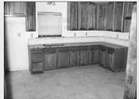
New kitchen cabinets and floor tile!

Please support these vendors and thank them for helping PV Shelter.